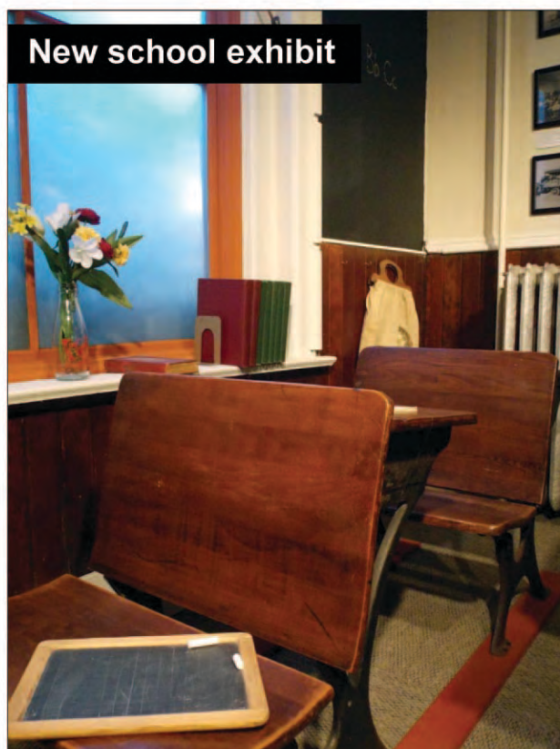
New school exhibit