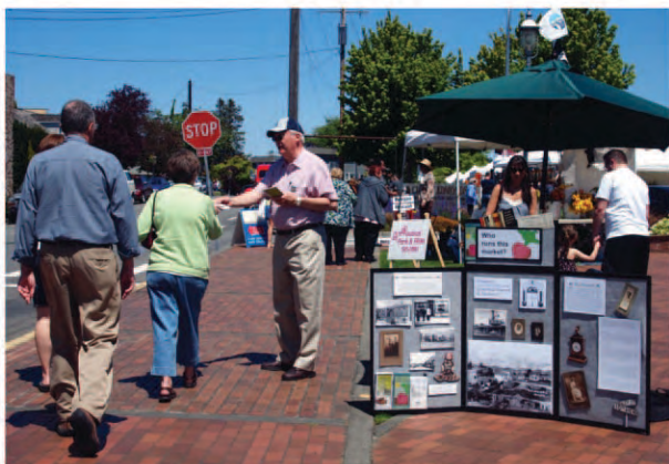
Look for our membership table at the market!