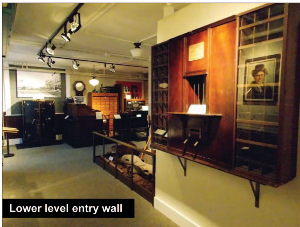
Lower level entry wall

The month of April brought many changes to the museum! Some of these changes include the addition of a beautiful Victorian dollhouse and new school history exhibit on the lower level, and the opening of our summer farming exhibit (complete with farm kitchen) on the upper level. If you haven't seen the remodeled museum yet, please stop by soon... and bring your friends!