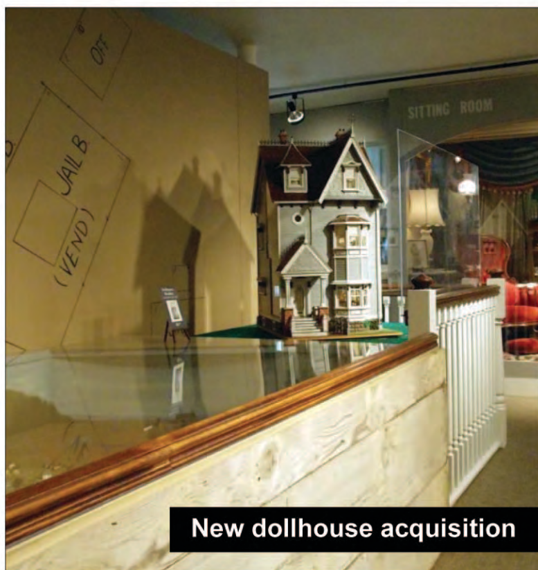
New dollhouse acquisition